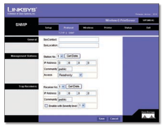
Protocol > SNMP

The appropriate MIB file must be imported into your SNMP management program using the Import-Compile command. Check your program's documentation for details on this procedure. The MIB file is named Mib2p.mib and is provided in the MiB folder on the Setup CD-ROM.